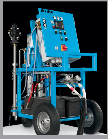
WIWA PU 460 Polyurea Systems