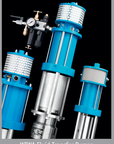
WIWA Fluid Transfer Pumps for diverse applications