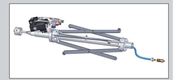
PU 4040 Automatic Gun for internal pipe coating with Polyurea (on request)