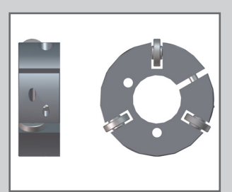
Centering guide with rollers 69-78,5 mm Order No.0657948* 77,5-97 mm Order No. 0657949* *(2pcs.)