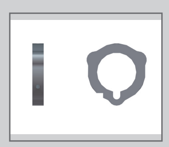
ø 50 mm Order No. 0658050* ø 60 mm Order No. 0658051* ø 65 mm Order No. 0658052* *(2pcs.)