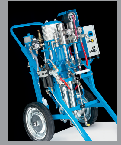
WIWA DUOMIX Plural Component Airless Paint Spraving Equipment