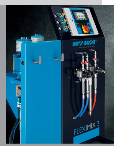
WIWA FLEXIMIX Electronic 2K Paint Spraying and Coating Equipment