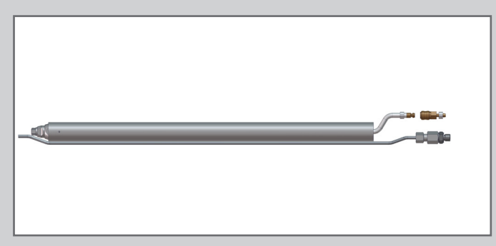
Lance with motor 600 mm long Order No. 0656960