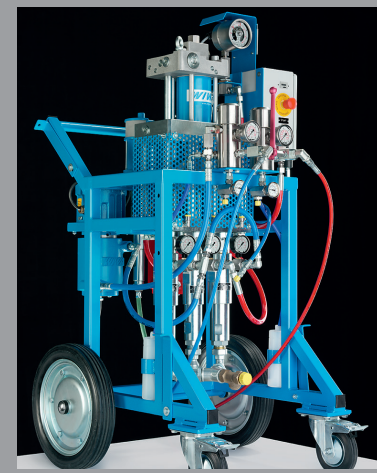
WIWA POWERPACK XXL 2K Hydraulic Systems