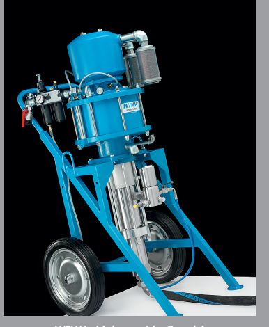
WIWA Airless, Air-Combi and Hot Spraying Systems