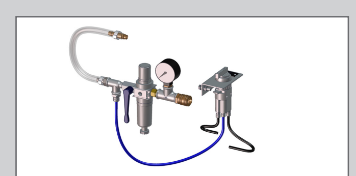
Regulator unit for internal pipe coating Order No. 0655044