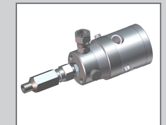
Automatic valve for internal pipe coating Order No. 0655976