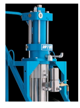
Hydraulic motor D99.9/120 for POWER PACK XXL